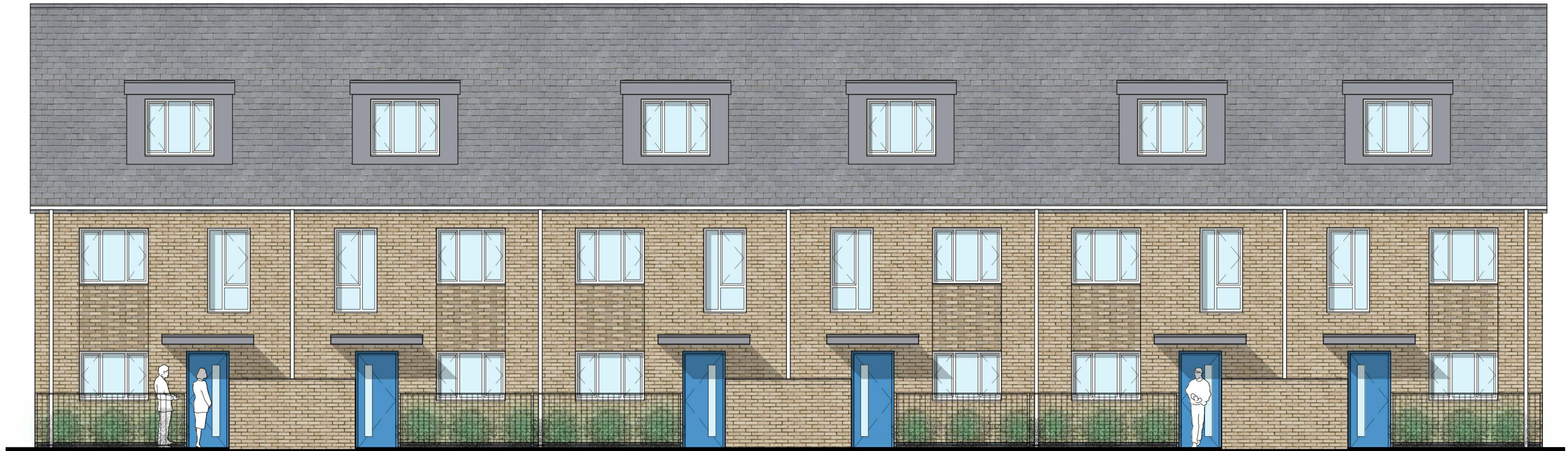
Houses Front Elevation